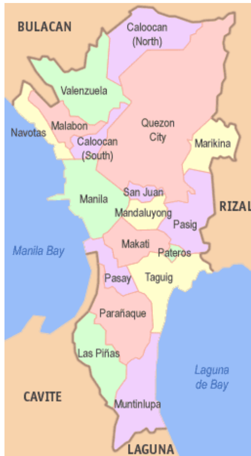
Figure 1: Metro Manila map

Figure 2, compare the rates of modern contraceptive use of women 20 to 45 years old in various cities of the National Capital Region between 1993 and 2008, based on data from the Demographic and Health Surveys. 3 . All cities in the National Capital Region, except for Manila, exhibit a clear increasing trend in contraceptives use between 1993 and 2008. The data for Manila shows a fall from 35% to 30% between 1993, before the election of Atienza, and 2003, three years after the ban was enacted. A fall is also