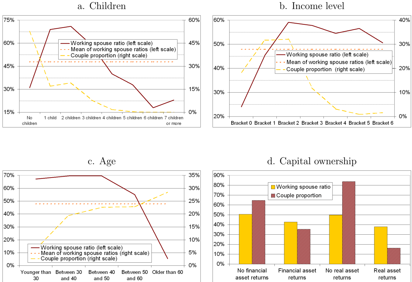
Figure 3: Determinants for second earner participation

variable, they demonstrate that without other incidences, having three or more children constraints the women participation to labor market. In addition, the low participation rate for couple without any child in charge is due to three causes. First, there are some young couples whose secondary earner is still a student. Second, there are some old couples, whose children are not in charge any more, and who are retired. Third, other age couples without children may more easily stay out of the labor market because they have less responsibility.