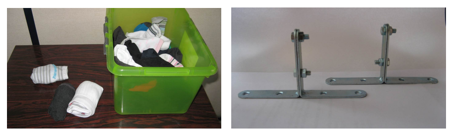
(a) The Sock Task